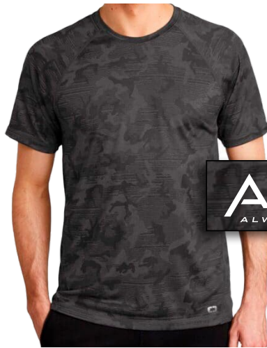
Screen printed on left sleeve