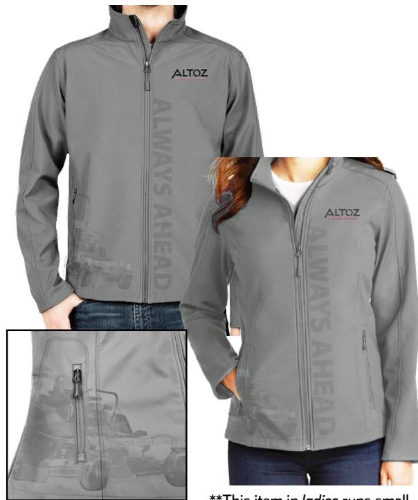
Close-up of laser etching on front of jacket

**This item in ladies runs small ordering one size up is recommended.