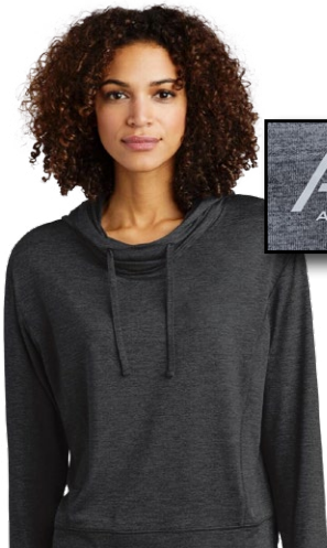
Heat-pressed Altoz logo on left sleeve