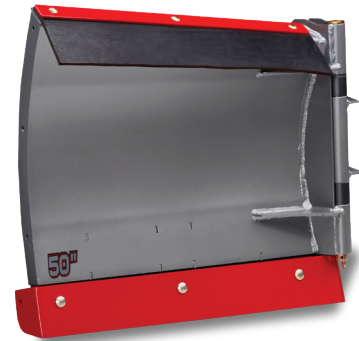
V-Plow - Shown with 2500725 Snow Flap Kit