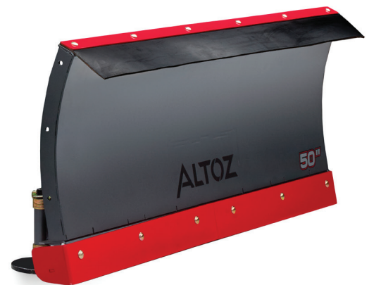
Straight Blade - Shown with 2500726 Snow Flap Kit