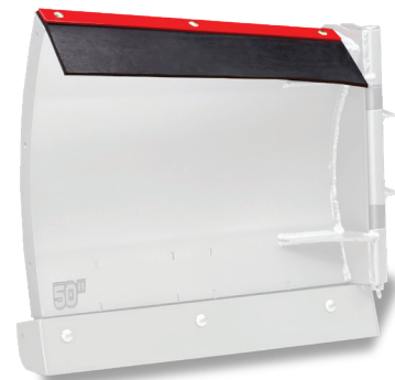
Snow Flap Kit Shown on 1060000 V-Plow