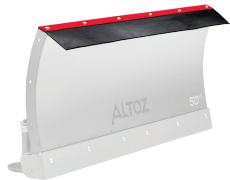
Snow Flap Kit Shown on 1060001 Straight Blade